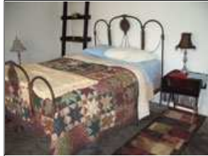
Lower Level Bedroom Has full size bed and picture window.