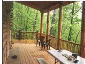
Main Level Porch Huge porch with gas grill and picnic table.