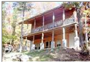
Covered Porches Huge upper and lower level porches with beautiful views.