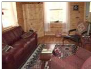
Living Room Warm hearted and comfortable.