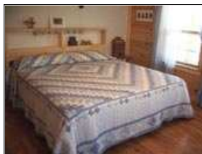
Master Bedroom Has king size bed.