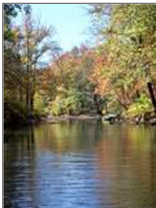
Little Buffalo River Ten minute walk from house.