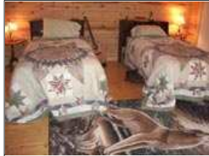
Upstairs Bedroom Has comfy twin beds with full bathroom.