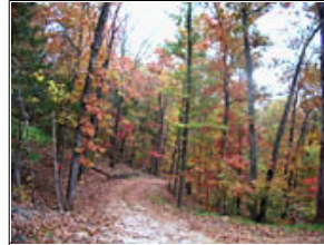
Secluded Driveway Lovely fall colors.