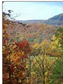
Beautiful Views View of Murray Valley from property.