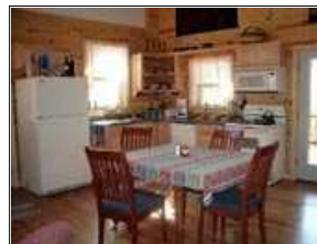
Kitchen Fully equipped. Table has extra leaf.