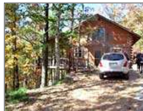
Front Entrance View of cabin from driveway.